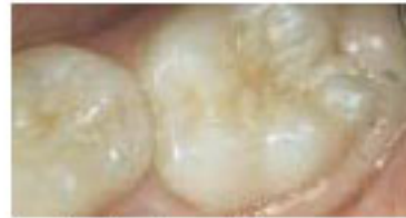
Chewing surface before sealant

Some six year permanent molars that are at risk may require fissure sealants. Here, a plastic coating that sets is placed in the grooves and fissures, protecting the surface