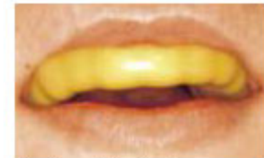
Mouth protector in place