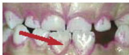
Plaque stained by disclosing agent