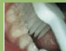
Make sure to clean the chewing surfaces.