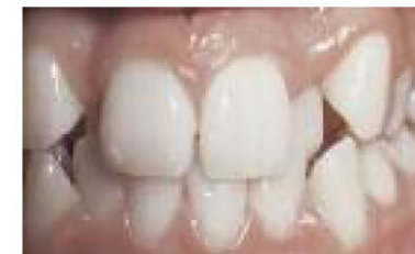
Crooked teeth before braces.

Some children have problems with crowded or crooked teeth or with incorrect bites. Sometimes the problems are inherited, for example, missing teeth or extra teeth, while other problems are caused by other factors such as thumb sucking or early loss of primary teeth. It is important to check with your dentist at an early stage of your infant's oral development so that emerging problems can be identified and treated at the appropriate stage. Early treatment can sometimes eliminate or reduce more extensive treatment later.