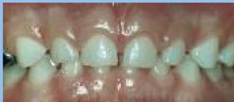
A healthy mouth in a 3 year old child