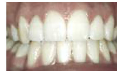
After tooth straightening

Most orthodontic problems are treated when the child has the majority of permanent teeth, from 10 years of age upwards. The problems of crowded, crooked or prominent teeth, for example, are usually treated with orthodontic appliances (braces) which can be either fixed (train tracks) or removable.