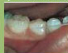
Repeat this procedure on each tooth. Don't forget the last four teeth.

Children aged seven years and older should be encouraged to clean their teeth and gums at least twice a day, using a small pea-sized amount of fluoride toothpaste. A good rule of thumb is before school and last thing at night, just before bed time.