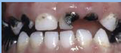
Nursing bottle mouth in a 3 year old child

It is important to ensure that your child has a diet which contributes to rather than damages the health of their teeth during infancy. It is important to realise that as soon as the child's teeth appear they are at risk of tooth decay. One of the most common ways in which a child's teeth are damaged is to give the child a bottle containing sweetened liquids after the age of one year, either as a pacifier during the day, or at nap or night-time.