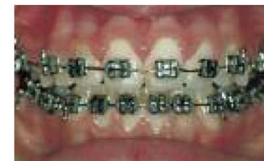
Braces in position

Most orthodontic problems are treated when the child has the majority of permanent teeth, from 10 years of age upwards. The problems of crowded, crooked or prominent teeth, for example, are usually treated with orthodontic appliances (braces) which can be either fixed (train tracks) or removable.