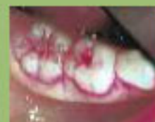
Use about 15 inches of floss, wind most of it around the middle finger of both hands. Hold the floss tightly between the thumb and forefinger. Use a gentle motion to guide the floss between the teeth.