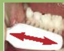
Holding the toothbrush bristles at a 45° angle against the gumline, move the brush back and forward with short strokes - half a tooth wide - in a gentle, scrubbing motion.

A variety of both brushing methods may be advised, yet, for children, over emphasis on a difficult technique may lead to confusion. It is better in many instances to instruct the child just to remove all the coloured plaque from the teeth. If areas are being constantly missed then assist the child to target the trouble spots. Brushing alone will clean three of the five surfaces of a tooth but to clean the remaining two surfaces in between the teeth, use dental floss. Hold the floss either between the fingers or in a floss holder, bend it around the surface of the tooth to be cleaned and move it up and down a few times. Some older children may find flossing difficult and like the child under seven do the cleaning for them.