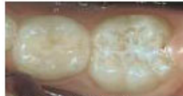
Tooth protected by fissure sealant

from the effects of retained food. Although this is an excellent technique it is important to remember that the sealant protects the chewing surface but there are other surfaces that are still vulnerable to decay. Other preventive measures may be taken: dietary control and tooth cleaning are essential, flossing is advisable and a fluoride mouthwash may be recommended by your dentist.