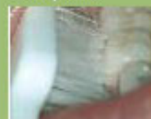
Brush the outer surface of each tooth, upper and lower. Repeat the same method on the inside surfaces and chewing surfaces of all teeth.