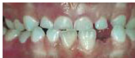
Teeth which appear clean before disclosing