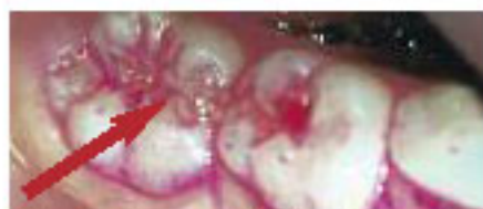
Note the plaque on the chewing surface.

Initially do this by wrapping a piece of gauze around a finger and rubbing the teeth and gums gently. In this way establish a cleaning habit early and the baby will become accustomed to it.