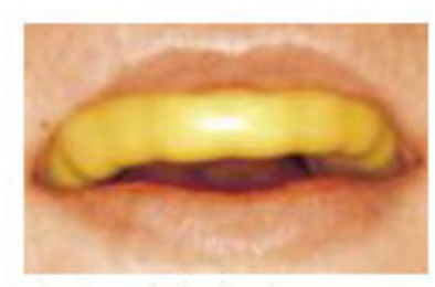
Mouth protector in place