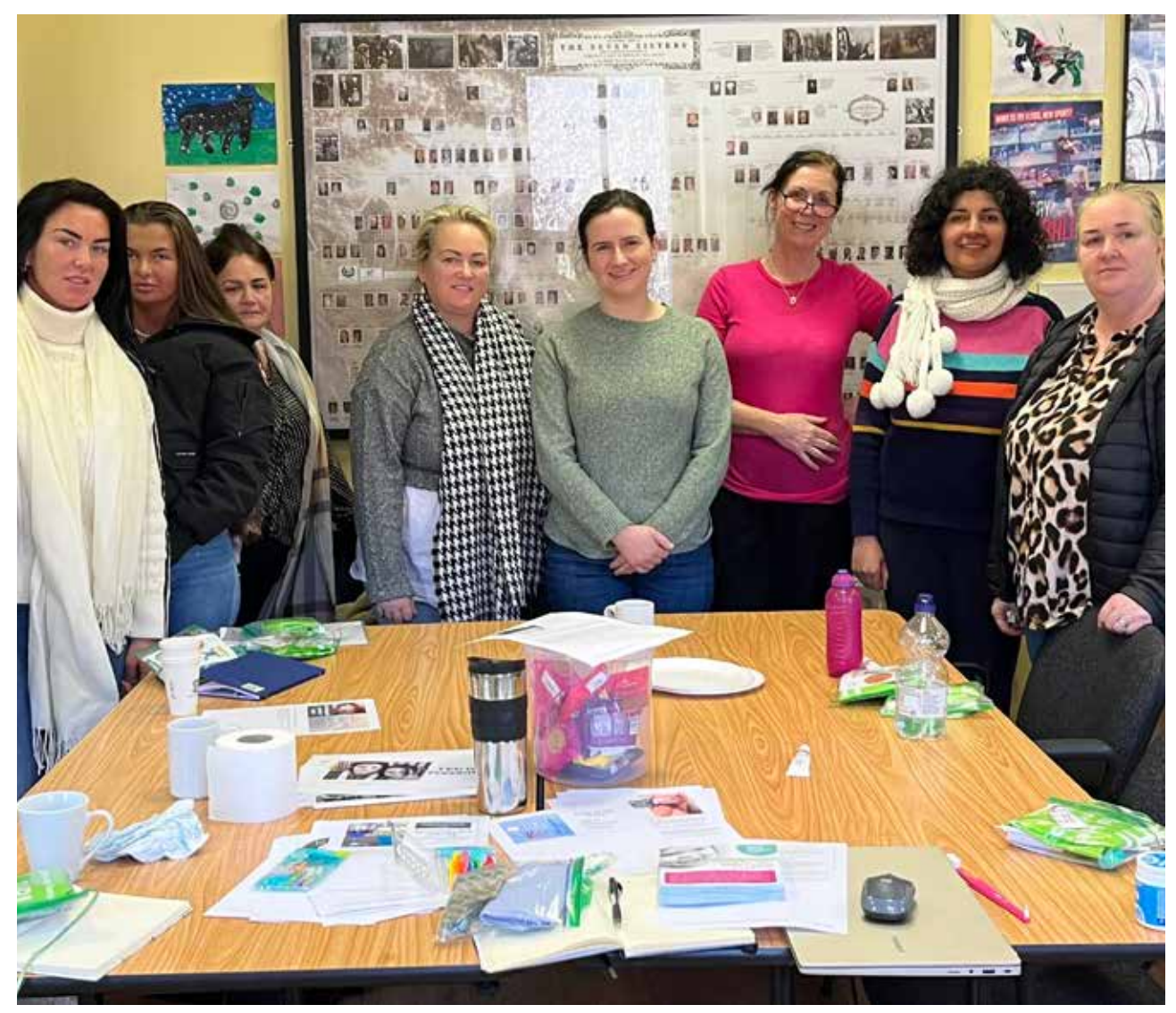
TVG Traveller Visibility Group Cork

Our work earlier this year with the National Children's Network (NCN) was to collaborate on developing visual resources for the NCN, CPD online members course on healthy teeth and gums. Our aim is to develop several animations / publications on promoting a range of key messages in oral health for early childhood care for providers/children and families. It is envisioned that the information developed will be distributed through the NCN networks including, their 3,800 members, Better Start, County Childcare Committees and through their cross-border networks.