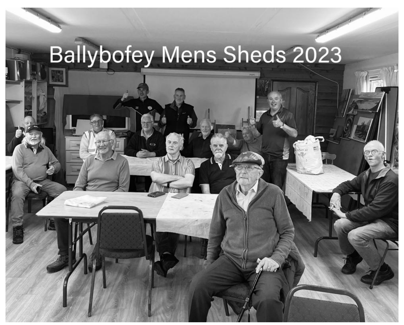
Ballybofey Men's Sheds

We began actively working with the Traveller/ Roma group of Traveller Primary Health Community Healthcare Workers (TPHCHW). The focus of the early meetings was identifying the gaps in the oral health knowledge of the TPHCWs for pregnancy and early years - what information was needed and the number of information sessions required. The outcome will be to develop culturally appropriate resources for Pavee Mothers - pregnancy, 0-2 years, followed by 2-5 years. This project is ongoing, and it is envisioned that there will be an explanation video and/or audio component to accompany visual printed materials.